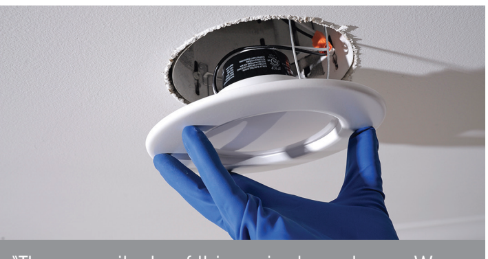
"The magnitude of this project was huge. We have 700 apartments – and every single energy efficiency improvement was knocked out of the park. It gives our residents a reason to stay."

The Multifamily Initiative identifies energy-saving opportunities and provides financial assistance and expertise for insulation, windows, weatherization in living spaces, heating and domestic water heating equipment, common area and exterior lighting, HVAC controls and more.